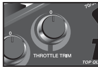
Make sure the throttle trim knob is centered.